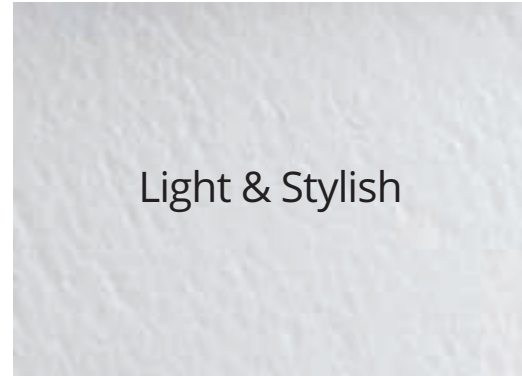
Light & Stylish