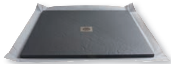
Overlapping waterproof fleece attached to the back

Decotray is supplied with an overlapping waterproof fleece attached to the back which, when sealed to the surrounding floor and walls, creates a completely waterproof barrier. The tray's concealed edges can be cut to size if required. Use Marmox Multiboard adjacent to the tray for a guaranteed waterproof system.